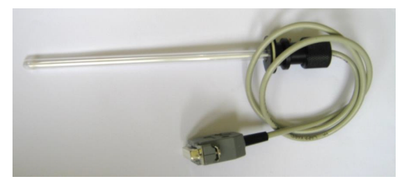
Figure 1: Temperature sensor