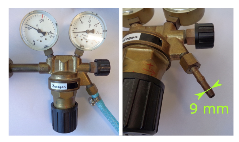
Figure 2: Reduction valve with 9mm tube counterpiece

Argon gas is used as the protective atmosphere during the high temperature measurements. Purity of the gas is not critical, we recommend purity 99.5%, but purity 99.9% is better and price difference is negligible. We recommend to order at least 20 litre bottle. It is necessary to have pressure reduction valve on the bottle with range of output pressures form 0 up to approx. 10 bars (150 psi). Inner diameter of the argon tubing is 8 mm (5/16 inch) so the counterpiece on the valve must be prepared for such tube (ideal diameter is 9 mm). See pictures below.